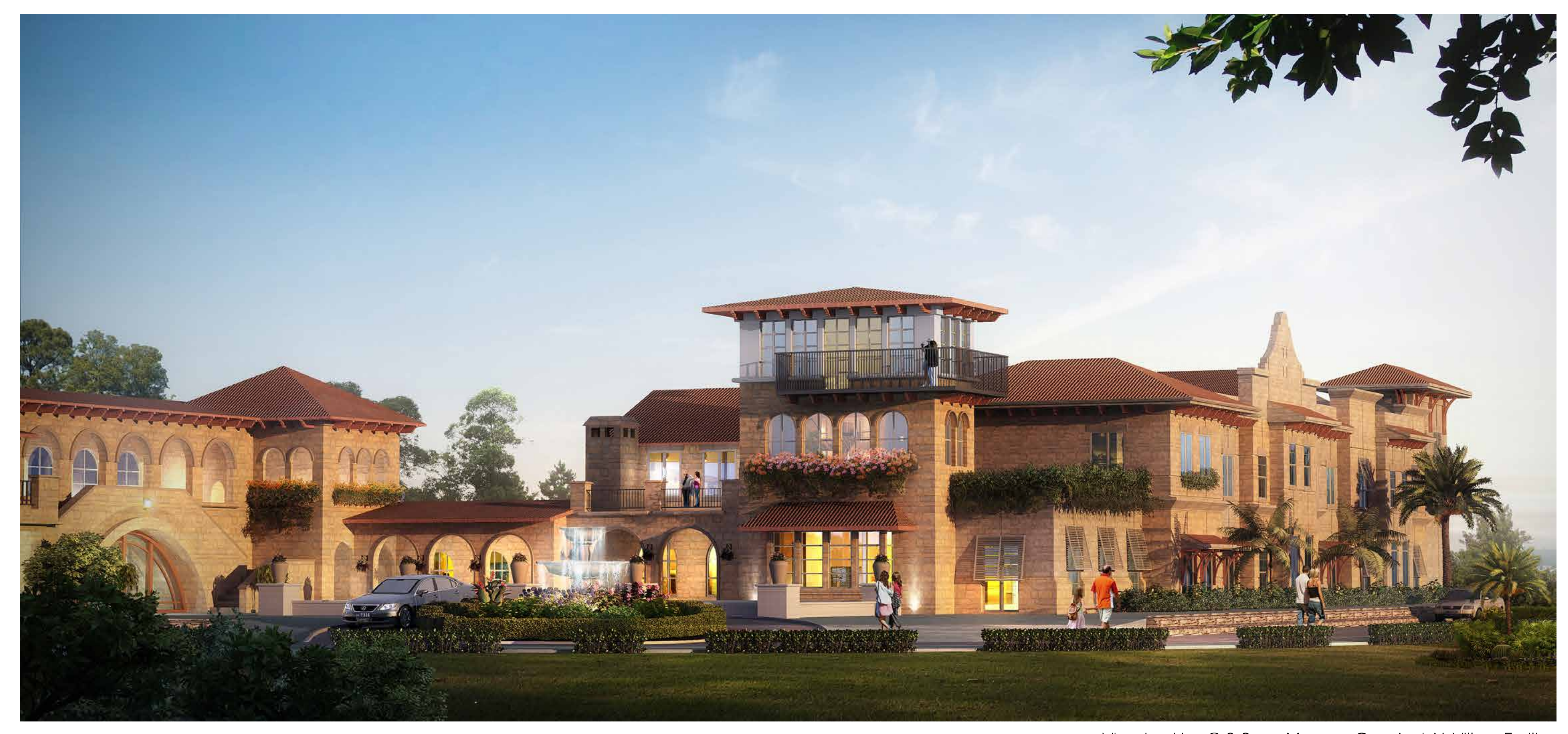
View Looking @ 2 Story Memory Care And AL Village Facility